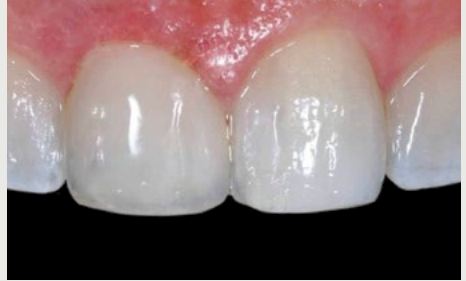
Clinical case, before and after, with BEAUTIFIL II Enamel