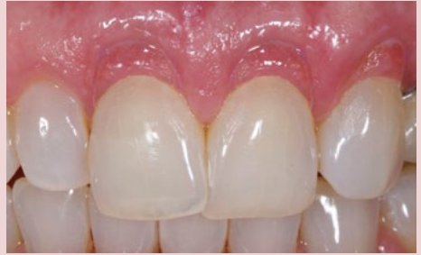
Clinical case, before and after, with BEAUTIFIL II Gingiva in Light Pink